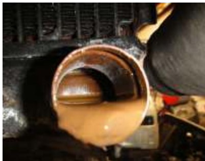
Rusty radiator sludge

There will also be a slow reduction of old scale layers due to the law of mass action and the sheer force of the flowing water. A smooth scale reduction will slowly increase the pipe capacity and so makes system functioning more efficient."